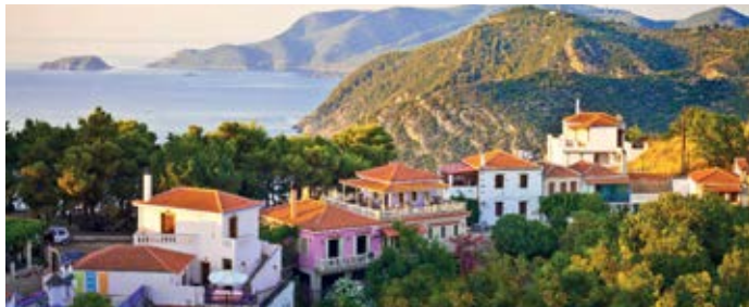
Alonissos Old Town